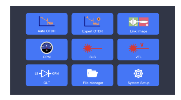
Main Menu of ADVANCED models