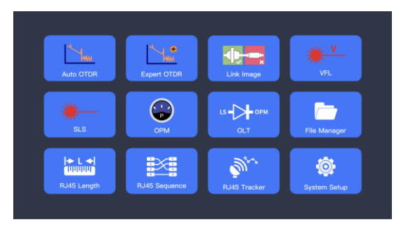
Main Menu of BASIC models